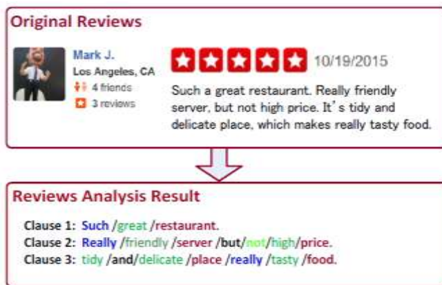
Fig. 3. An example of review analysis for identifying user's sentiment. Product features are denoted in red font, the sentiment words are denoted in green font, the sentiment degree words are denoted in blue font, the conjunction words like "and", "but" are denoted in blank font, and the negation words are denoted in bright green font.