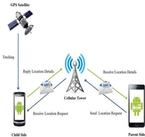
Fig 1. Architecture of Proposed System

Architecture of system shown in figure 1.