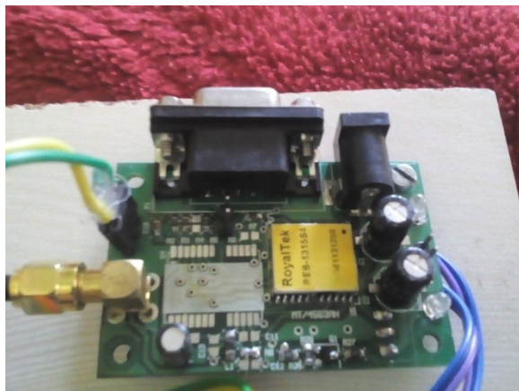
Fig. 3. GPS module

When supply is given to GPS board(fig.3), by means of current sensation position of child get tracked and data get forwarded to microcontroller.