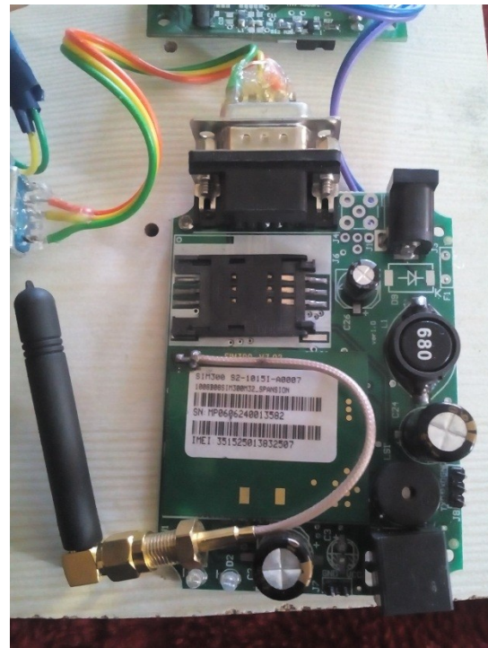
Fig. 4. GSM module

By sensing child's position through current, the GSM module(fig.4) receives longitude and latitude signals and send it to parents mobile.