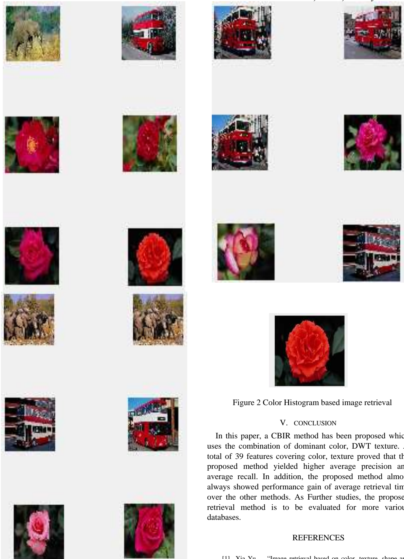
Figure 2 Color Histogram based image retrieval